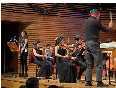
Student singing Howard Blake's 'Walking in the Air'