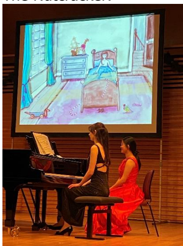
Piano students performing Tchaikovsky's The Nutcracker with illustrations from Emily Woodard.