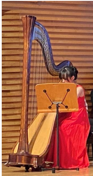
The harp being played beautifully.