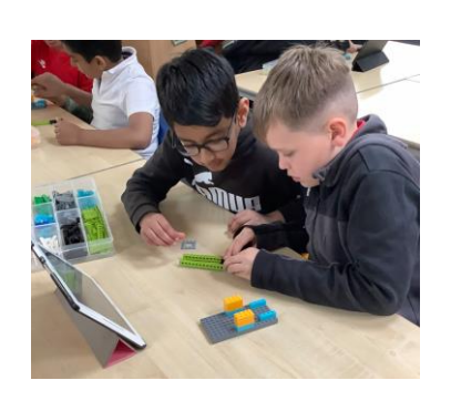
Year 5 participated in a STEM Lego Robotics Workshop on Wednesday.