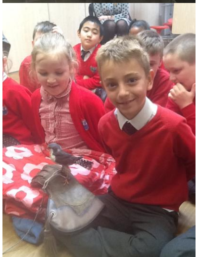
'On Monday 16th April, Year 3 were lucky enough to have a visit

from Falconry UK. They brought in some amazing birds of prey to show us and we learnt absolutely loads! It was a great start to our new ILP, 'Predator'!