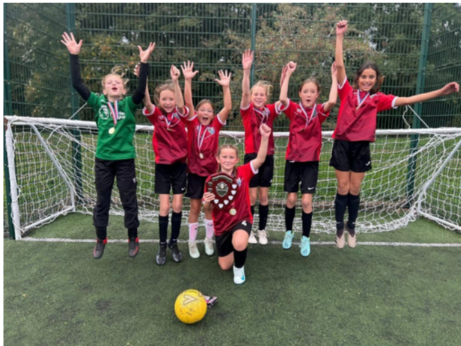
Girls Football Competition Winners

I was really proud of them all and to be associated with Ashford Park.’