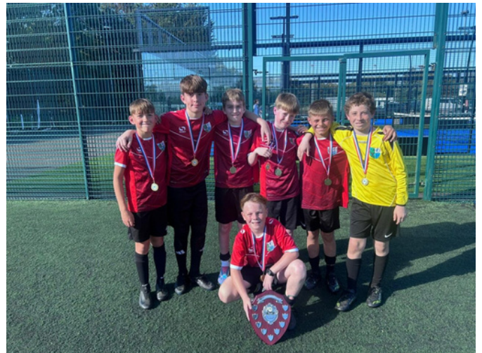
Boys Football Competition Winners