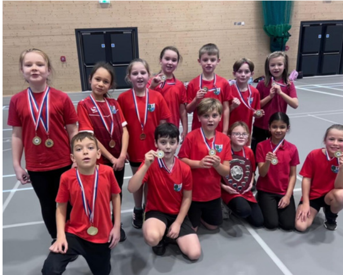
Year 3 & 4 Dodge Ball Competition Winners