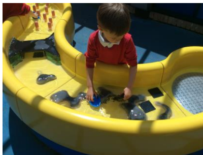
"The boat is going down the water using the force of the water" by Oscar D