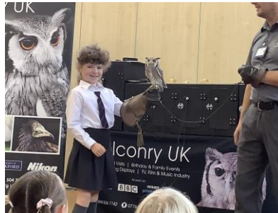
Meet Robin and Bailey

last week, when year 3 received a visit from Falconry UK to support their knowledge and understanding of their ILP, 'Predator!'