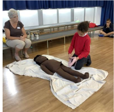
The embalmers removed the organs through a slit in the left side of the body, BUT always returned the heart.