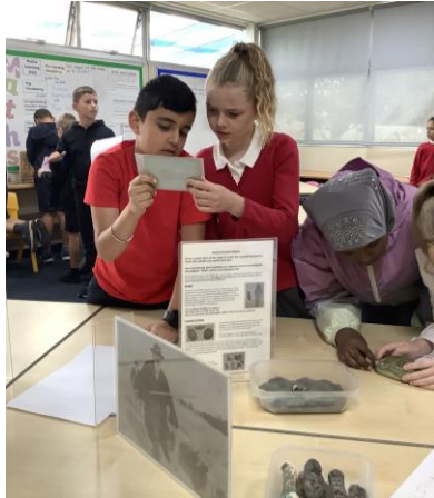
Did you know that the mummification process took 70 days!

Year 5 were immersed in an ancient Egyptian world and learnt about the mummification of pharaohs with the removal and storage of their lungs, intestines, stomach and liver in canopic jars, as ways of preserving the Egyptian pharaohs into their afterlife.