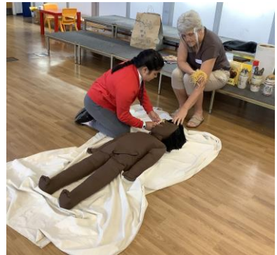
After 40 days, the body was stuffed with linen or sand to give it a more human shape.