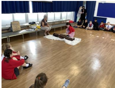
The chief embalmer was a high priest who wore the mask of Anubis, the jackal headed God of the Dead.